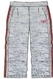
PE PANTS GIRLS