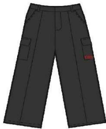
GREY CARGO TRS. BOYS