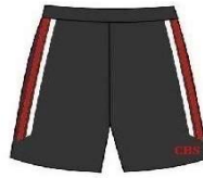
PE SHORTS BOYS