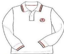
LONG SLEEVE POLO T-SHIRT