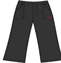
GREY TROUSERS GIRLS