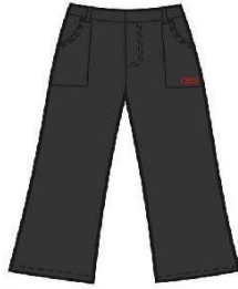
GREY TROUSERS GIRLS