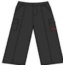
GREY CARGO TRS. BOYS