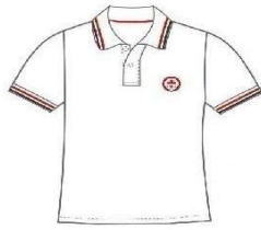
SHORT SLEEVE POLO T-SHIRT